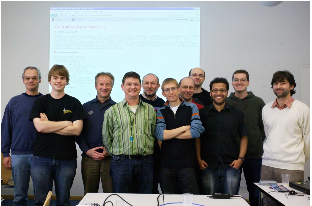
Figure 3 – The ISSI Team “Virtual Observatory for meteoroids”.